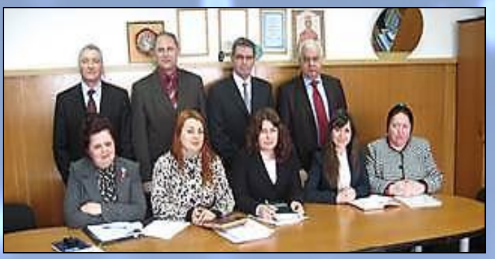
IER Department reached an honorable age of 20 years. What are its achievements during this period?

Once you understand the essence of the economic processes taking place around, you feel the need to discuss it with someone. The student audience is the most suitable for it.